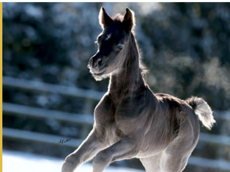
First foal 2026: GR Fadishah Black filly, GR Ishad x GR Farasha (full-sister to GR Fasin)

GR Nashidah (Classic Shadwan x Nejdschah) mother of our homebred stallions GR Nashad (gold premium stallion; father of GR Ishad) and GR Lahab. Black-bay filly GR Nasinah 2023 (by GR Fasin) beside